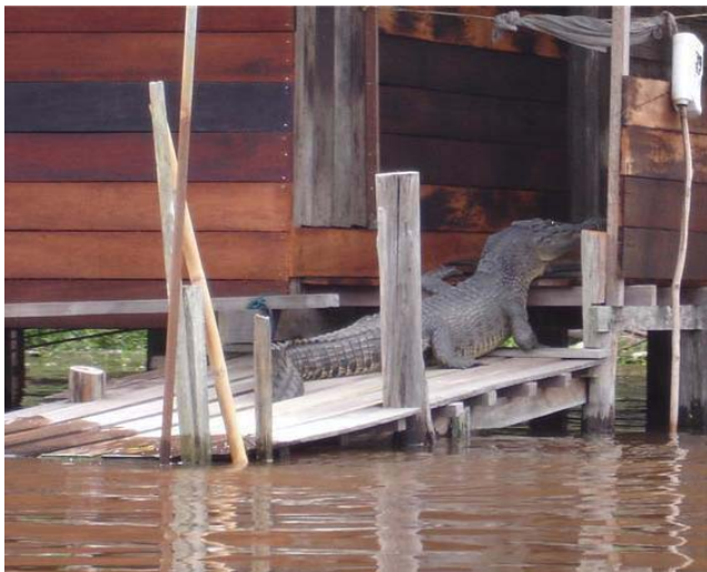
Not someone you want to come calling for lunch!